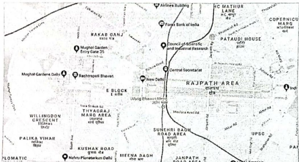
(Map with entry location at Gate 35 highlighted)